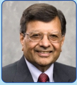
Dr. Jagdish Sheth Emory Business School Founder Chairman, AIM